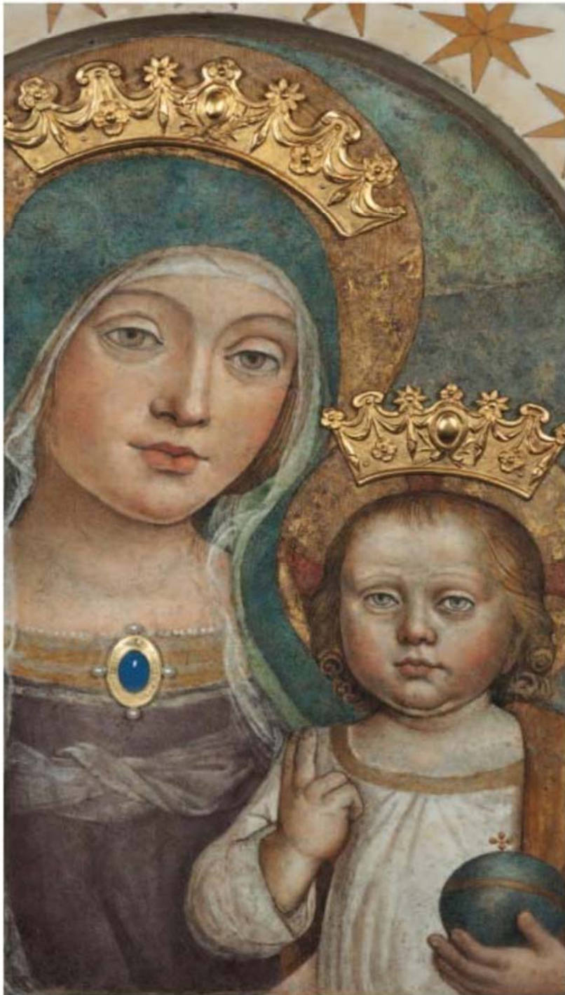
The ancient fresco of Madonna del Soccorso (Our Lady of Help) in St. Peter's Basilica was restored with the support of the Knights of Columbus to mark the Year of Faith (2012-2013).

O Mary, you always brighten our path as a sign of salvation and of hope. We entrust ourselves to you, Health of the Sick, who, at the Cross, took part in Jesus' pain while remaining steadfast in faith. O loving Mother, you know what we need, and we are confident you will provide for us as at Cana in Galilee. Intercede for us with your Son Jesus, the Divine Physician, for those who have fallen ill, for those who are vulnerable, and for those who have died. Intercede also for those charged with protecting the health and safety of others and for those who are tending to the sick and seeking a cure. Help us, O Mother of Divine Love, to conform to the will of the Father and to do as we are told by Jesus, who took upon himself our sufferings and carried our sorrows, so as to lead us, through the Cross, to the glory of the Resurrection. Amen.